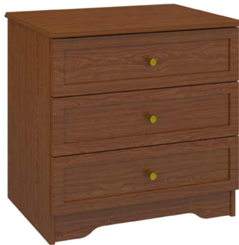
Model: LACH30W 31.5W 19D 30H

The Lancaster Collection offers unobtrusive refinement and skilled craftsmanship to form the perfect balance between function and beauty. Rich OG detailing on the tops and recessed insert panels set into chamfered frames on doors and drawers. Collection available with or without contrasting edges as well as custom color combinations.